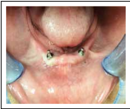
Fig. (2) Final placement of Short implants after the ball abutments screwed to it.