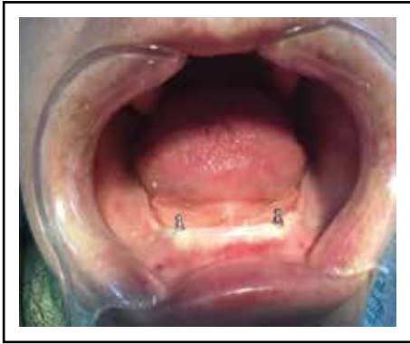
Fig. (1) Final placement of one-body Mini-implants with ball abutment attached to it.