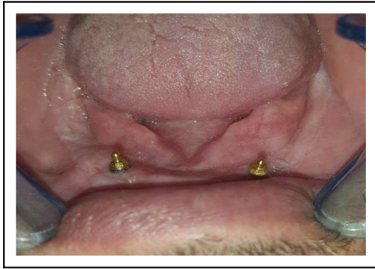
Fig. (1a) Patient has two implants with ball and socket attachment at the canine region