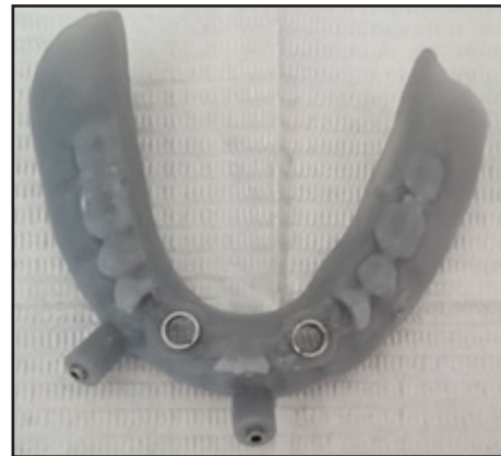
Figure(1) Surgical stent

Surgical procedures for implant installation: Patients were rehabilitated by mandibular over denture retained by two dental implants (3.7 mm in