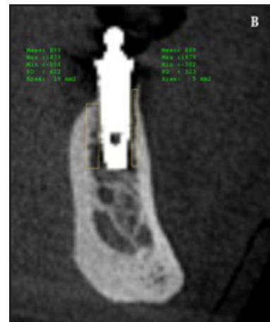
Figure (3) Bone density of the buccal and lingual surfaces of the left implant at loading

Bone density was measured in a rectangular area on each axial surface of the implant (Buccal, Lingual, Mesial and Distal) (fig.3).