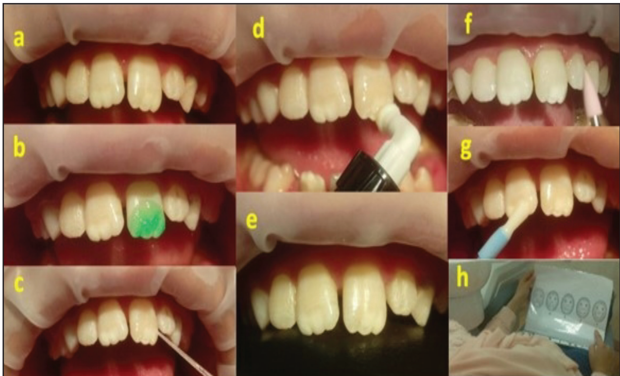
Figure 1): (a,b,c,d) and (e) Representing steps of resin infiltration, (f) Finishing of resin, (g) Application of fluoride varnish, (h) Facial image scale assessment