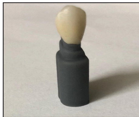
Figure (1): Zirconia crown seated on 3D printed resin die

Each constructed crown was checked for complete seating and fit on the master die, fig (1).