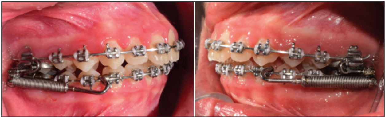
Figure (1) Intra-oral view of FFRD