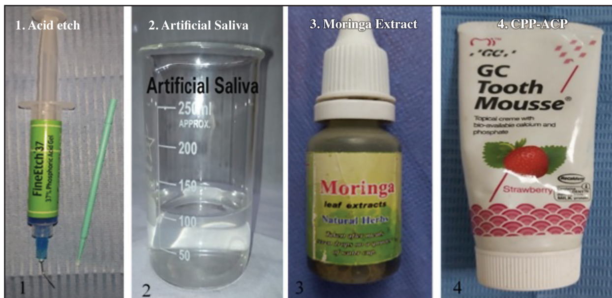
Figure (1) Materials used in this study.